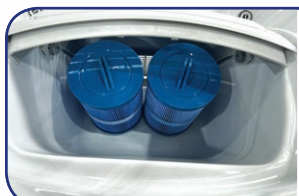
Top loading filters - easy to clean