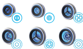
Premium self cleaning, LED "Aqua-ssage" Jets