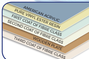
6 layer tough bond shell