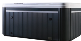
Thermo-wood maintenance free cabinet