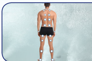
Powerful high flow massage jets