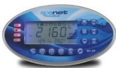
Australian smart SpaNET SV control system