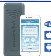
Optional feature - SmartLink to your phone