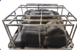
Stainless Steel frame with side and seat supports