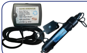
UV Ozone system - ultimate water management system